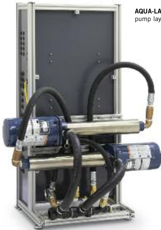
AQUA-LAB TXF Floor Mount pump layout for floor installation

AQUA-LAB TXW Wall Mount —comes with 15 chemical injectors but the cabinet as well as the pumps can be mounted on the wall wherever it meets your layout needs.