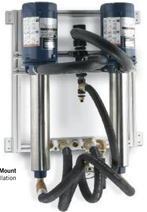
AQUA-LAB TXW Wall Mount pump layout for wall installation